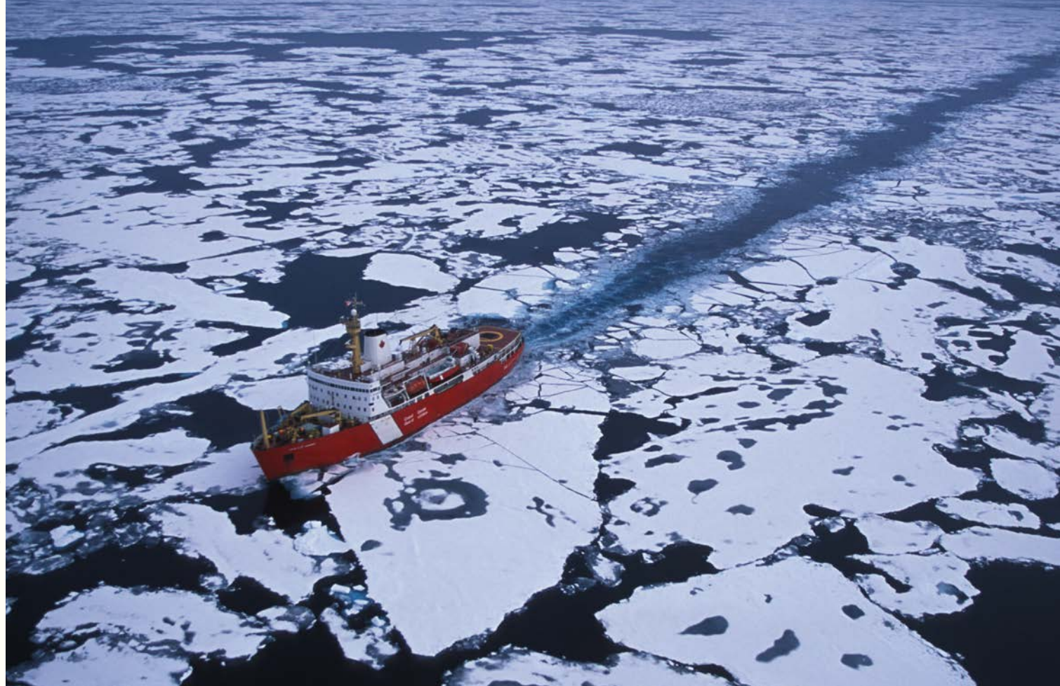
Aerial view of the Louis S. St.-Laurent, an ice-breaker research ship

The level of future shipping traffic in the Hudson Strait remains difficult to predict as it depends on local conditions and development factors of the surrounding region. What we know now, though, is that we are missing critical data from current shipping operations in the Strait and its impacts on local whale populations. By filling this knowledge gap, we can focus our future course of action, design new practices for operators to address uncovered issues, and implement additional best practices to highlight key habitats and species at risk.