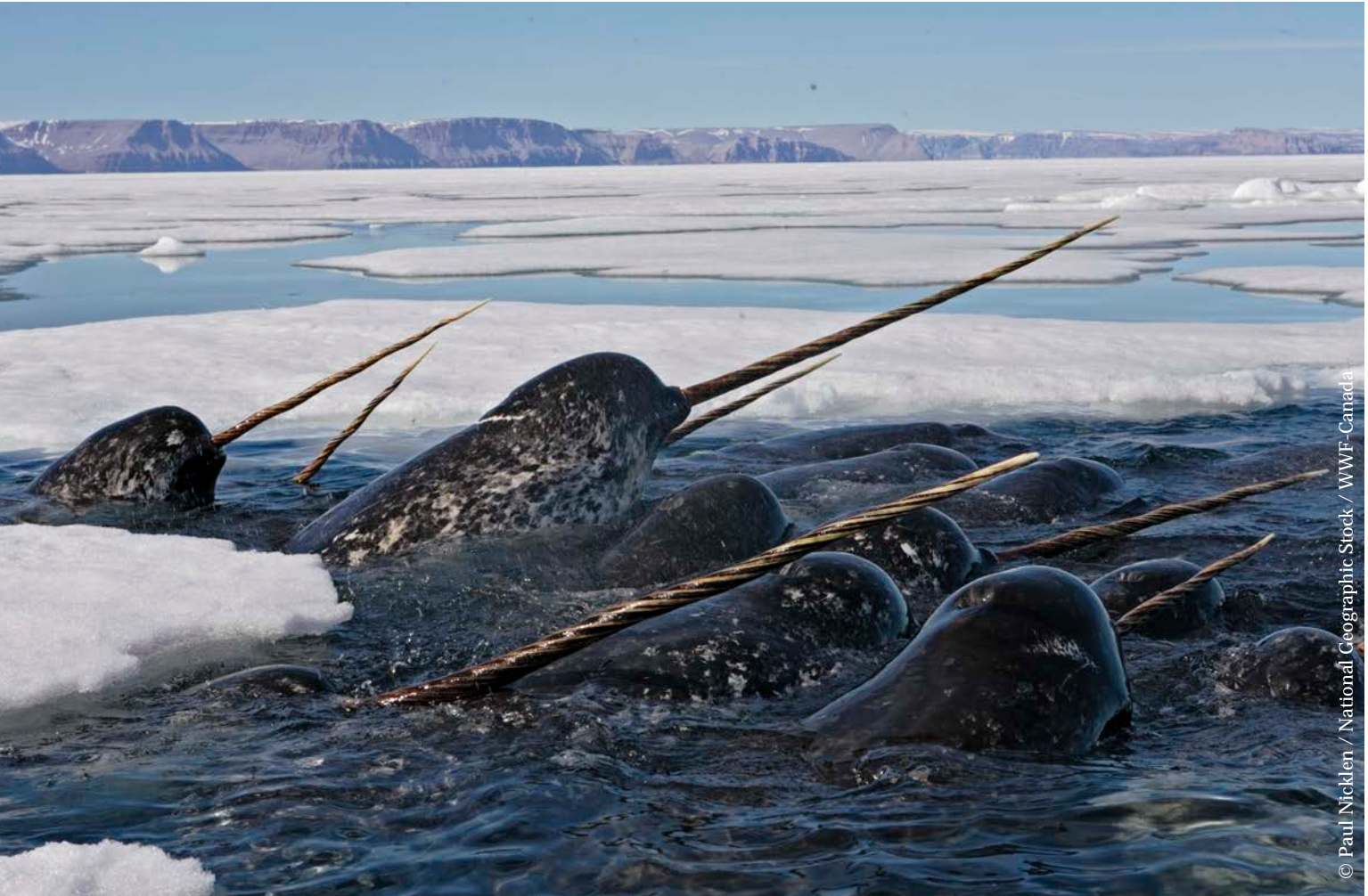
Several narwhal breaching the surface

The Hudson Strait is home to Inuit and a variety of Arctic nature. The Strait is characterized by a deep middle channel, relatively strong currents, and high tides. It is mostly covered by ice in the winter season: ice coverage is dynamic, with numerous leads, cracks, polynyas, and other features occurring predictably each season.