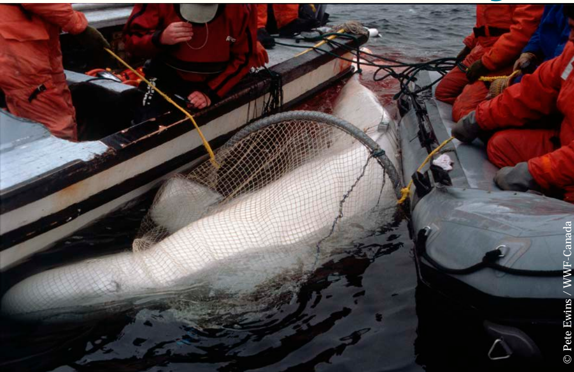
Scientists attach satellite-tracking tags to a Beluga whale in Cumberland Sound

Gaps identified by Vard Marine Inc. as having the highest priority for closure include a lack of accuracy for vessel transit records in terms of fidelity and georeferencing; a lack of detailed understanding of the effects of both noise and collisions on cetaceans; and a lack of detailed data on the spatial and temporal distribution of cetaceans in the Hudson Strait.