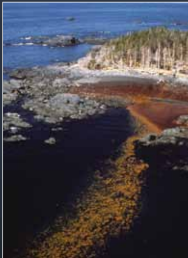
Exxon Valdez Trustees Council