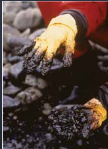
Exxon Valdez Trustees Council

20 YEARS AFTER THE EXXON VALDEZ DISASTER Little Has Changed in How We Respond to Oil Spills in the Arctic