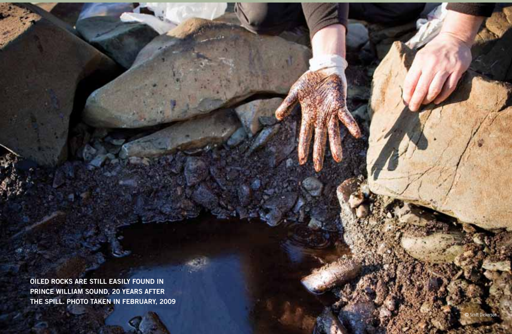
OILED ROCKS ARE STILL EASILY FOUND IN PRINCE WILLIAM SOUND, 20 YEARS AFTER THE SPILL. PHOTO TAKEN IN FEBRUARY, 2009