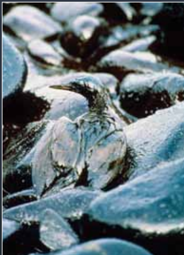
Exxon Valdez Trustees Council