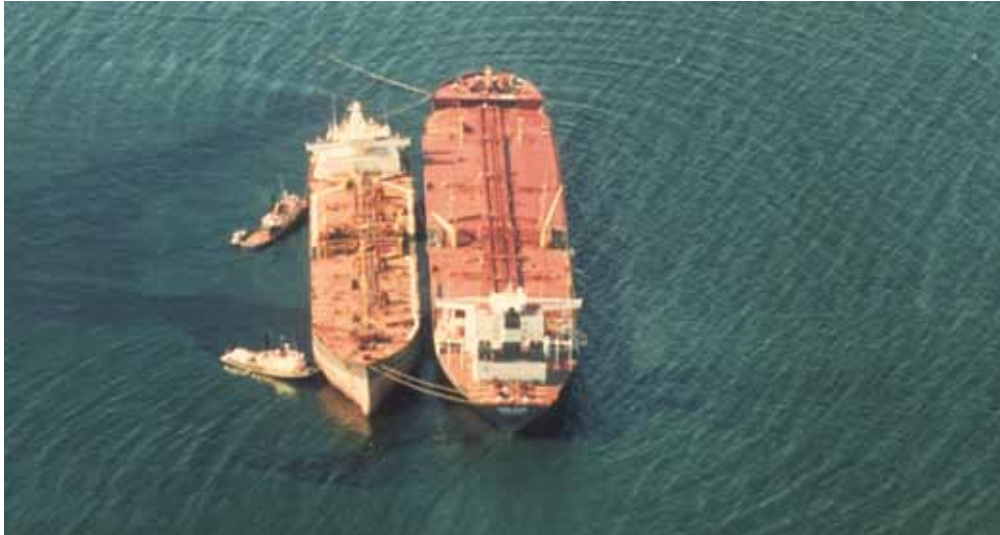
Exxon Valdez Trustees Council