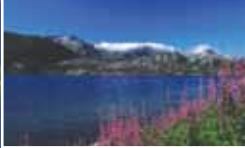
Lofoten Islands, Norway