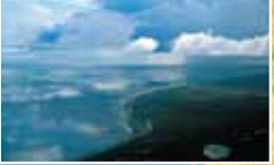
Bristol Bay, Alaska