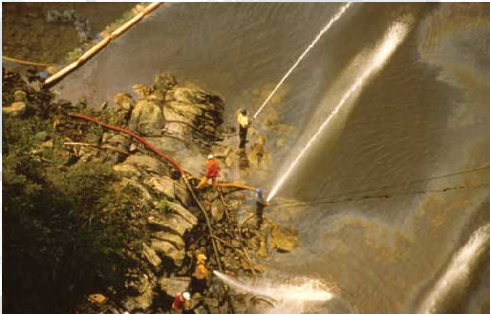
Exxon Valdez Trustees Council

THE EXXON VALDEZ SPILL POSED UNPRECEDENTED CHALLENGES TO PEOPLE AND EQUIPMENT. STILL TODAY, WIND, ICE, AND WEATHER IN ARCTIC WATERS PROMISE TO COMPLICATE AND CONFOUND OUR BEST EFFORTS AT EFFECTIVE SPILL RESPONSE.