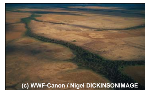
Natural Savannah burnt during severe drought and forest fires, Roraima State, Brazilian Amazon.